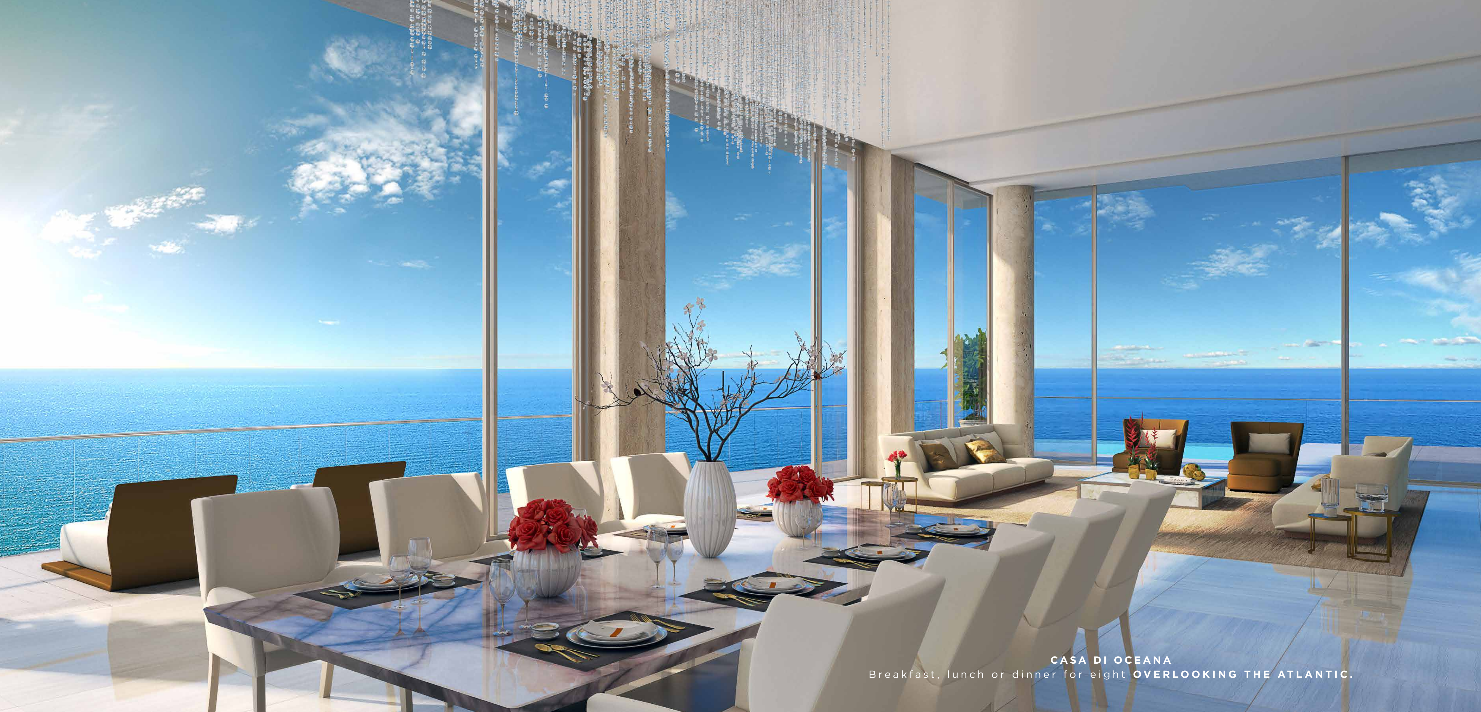
CASA DI OCEANA Breakfast, lunch or dinner for eight OVERLOOKING THE ATLANTIC.