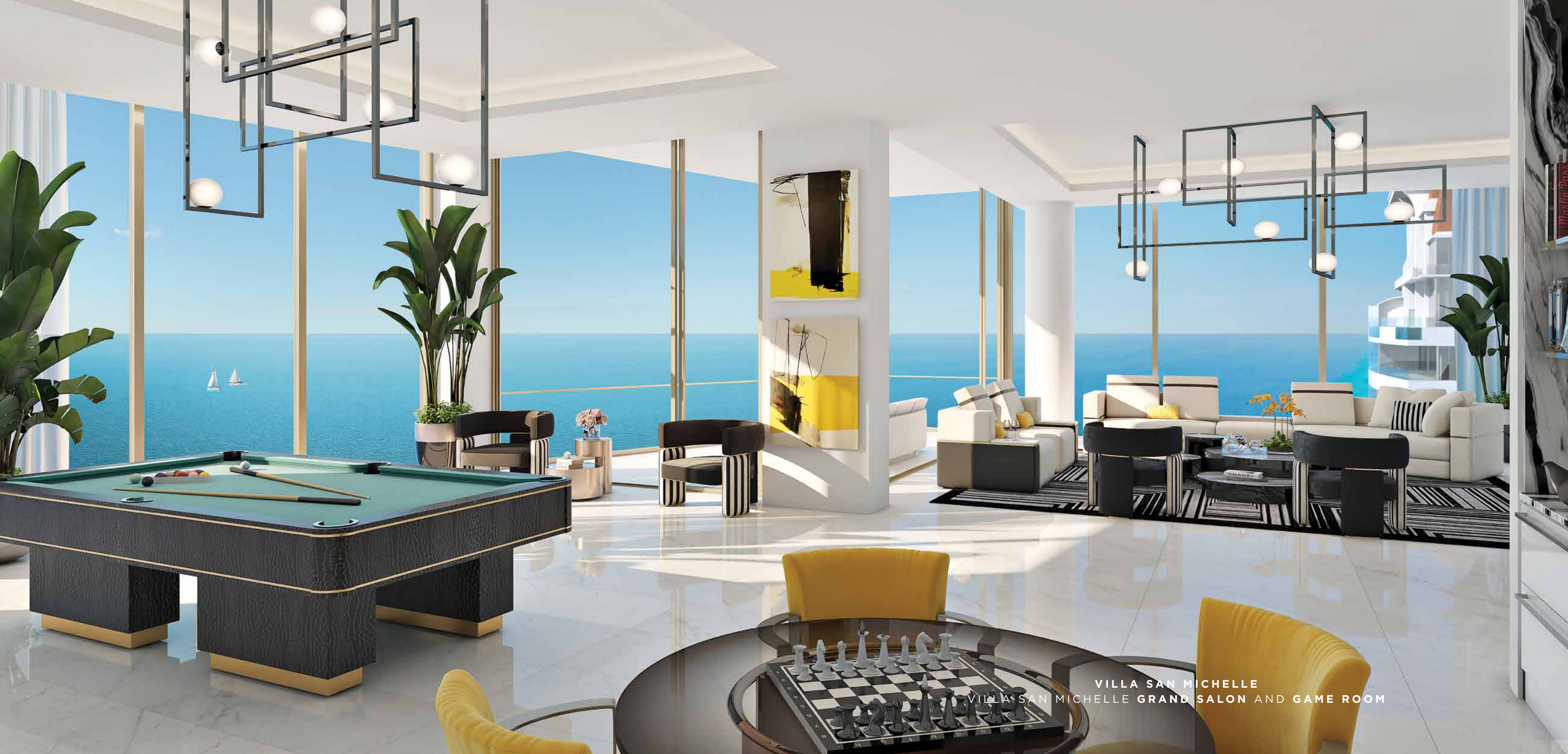
VILLA SAN MICHELLE VILLA SAN MICHELLE GRAND SALON AND GAME ROOM