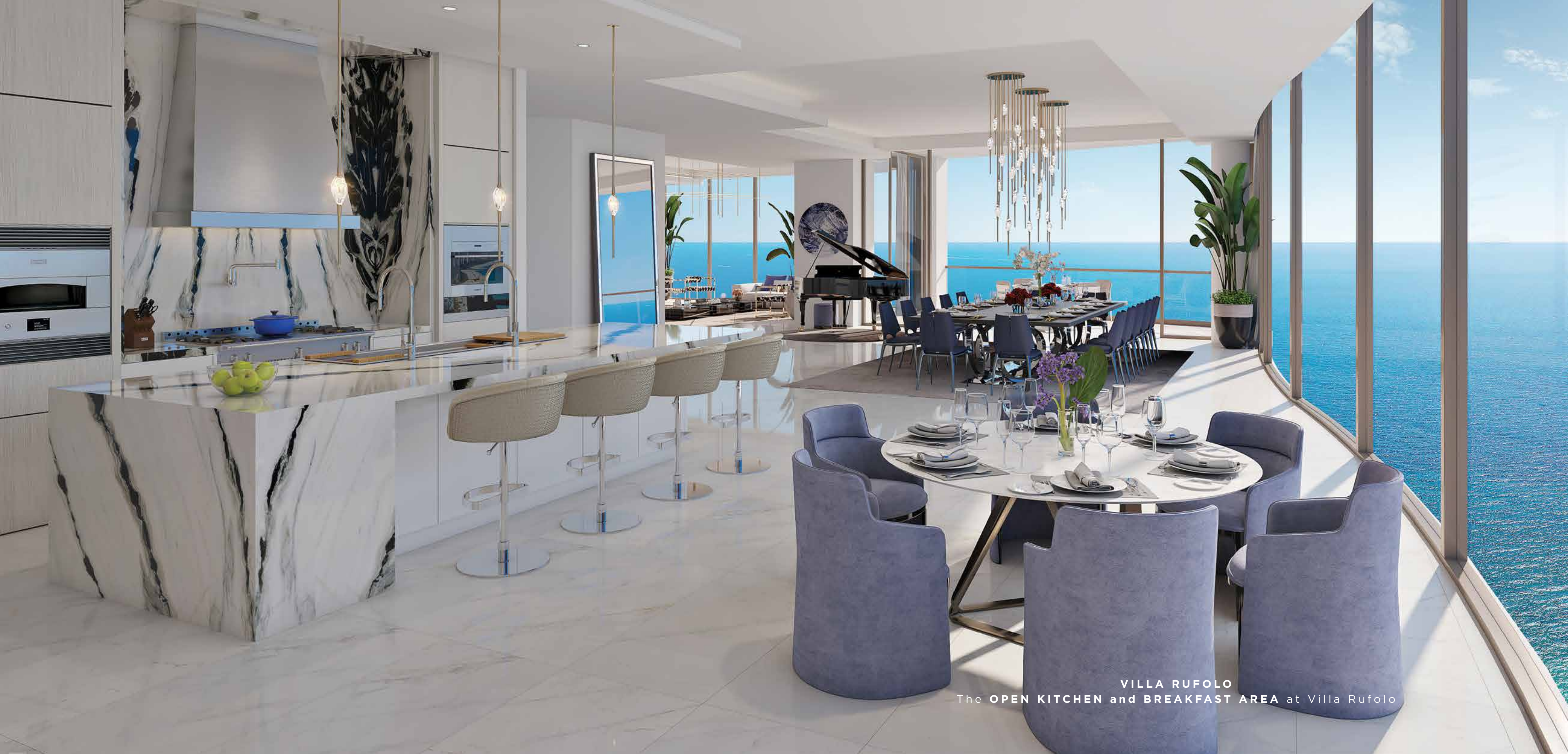
VILLA RUFOLO The OPEN KITCHEN and BREAKFAST AREA at Villa Rufolo