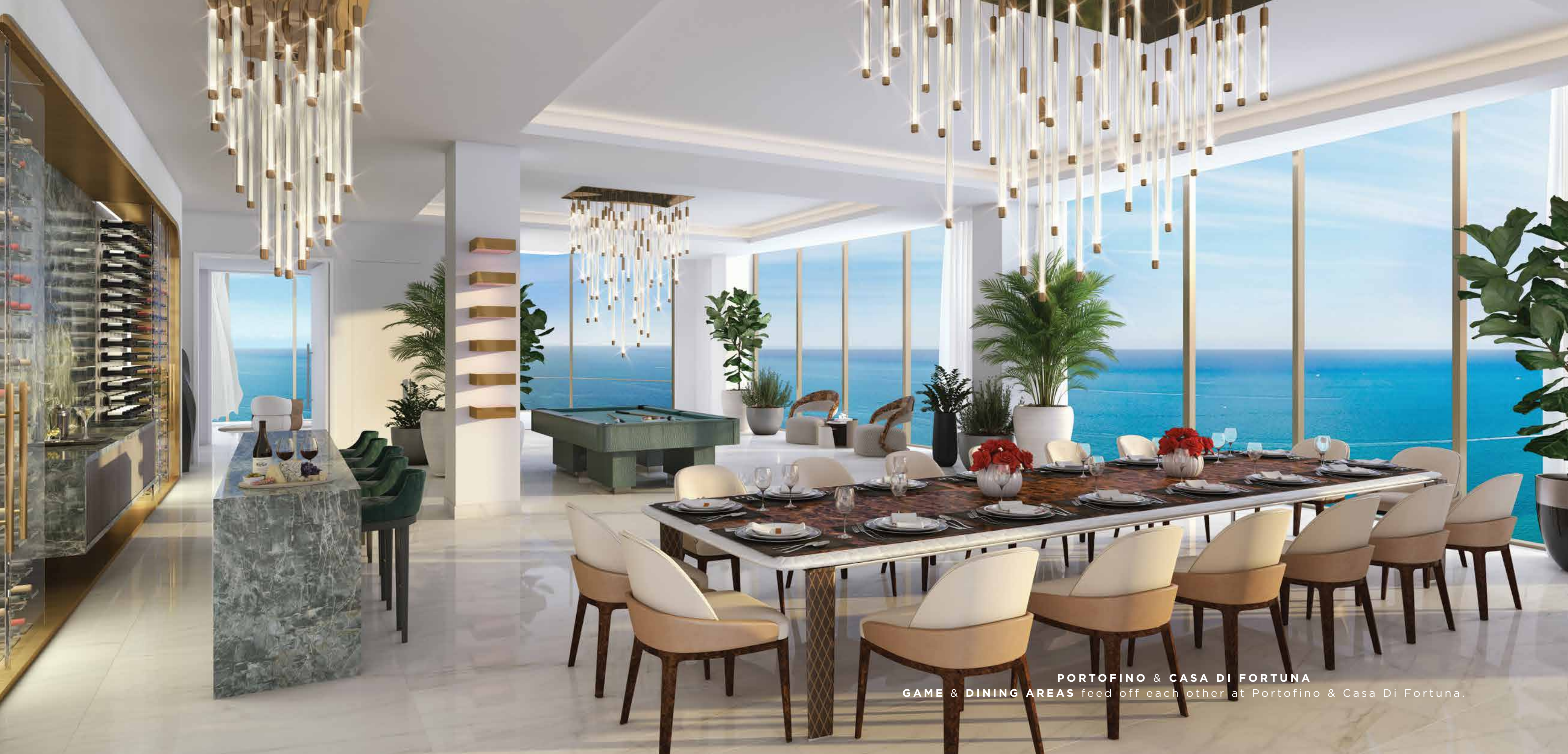
PORTOFINO & CASA DI FORTUNA GAME & DINING AREAS feed off each other at Portofino & Casa Di Fortuna.