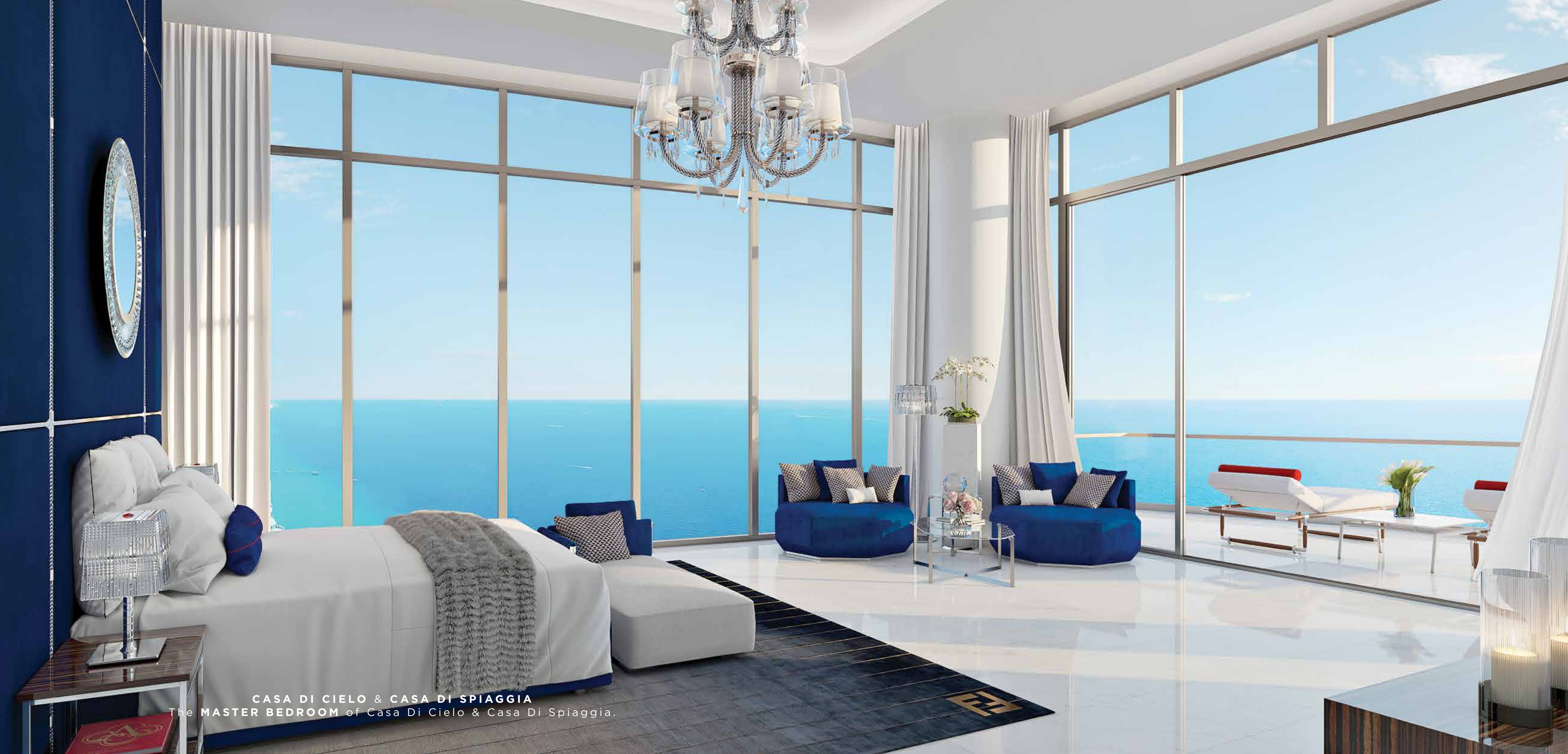
CASA DI CIELO & CASA DI SPIAGGIA The MASTER BEDROOM of Casa Di Cielo & Casa Di Spiaggia.