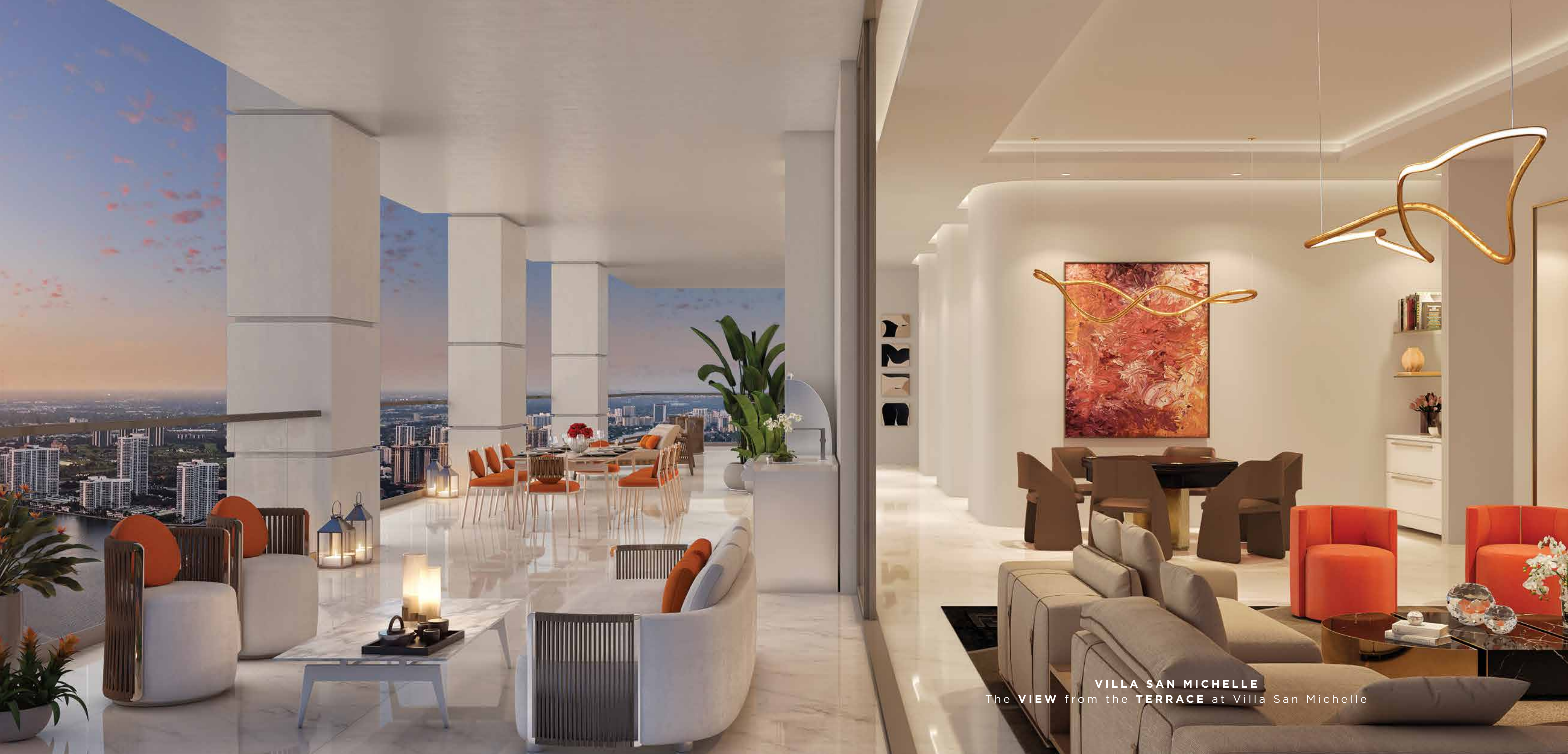
VILLA SAN MICHELLE The VIEW from the TERRACE at Villa San Michelle