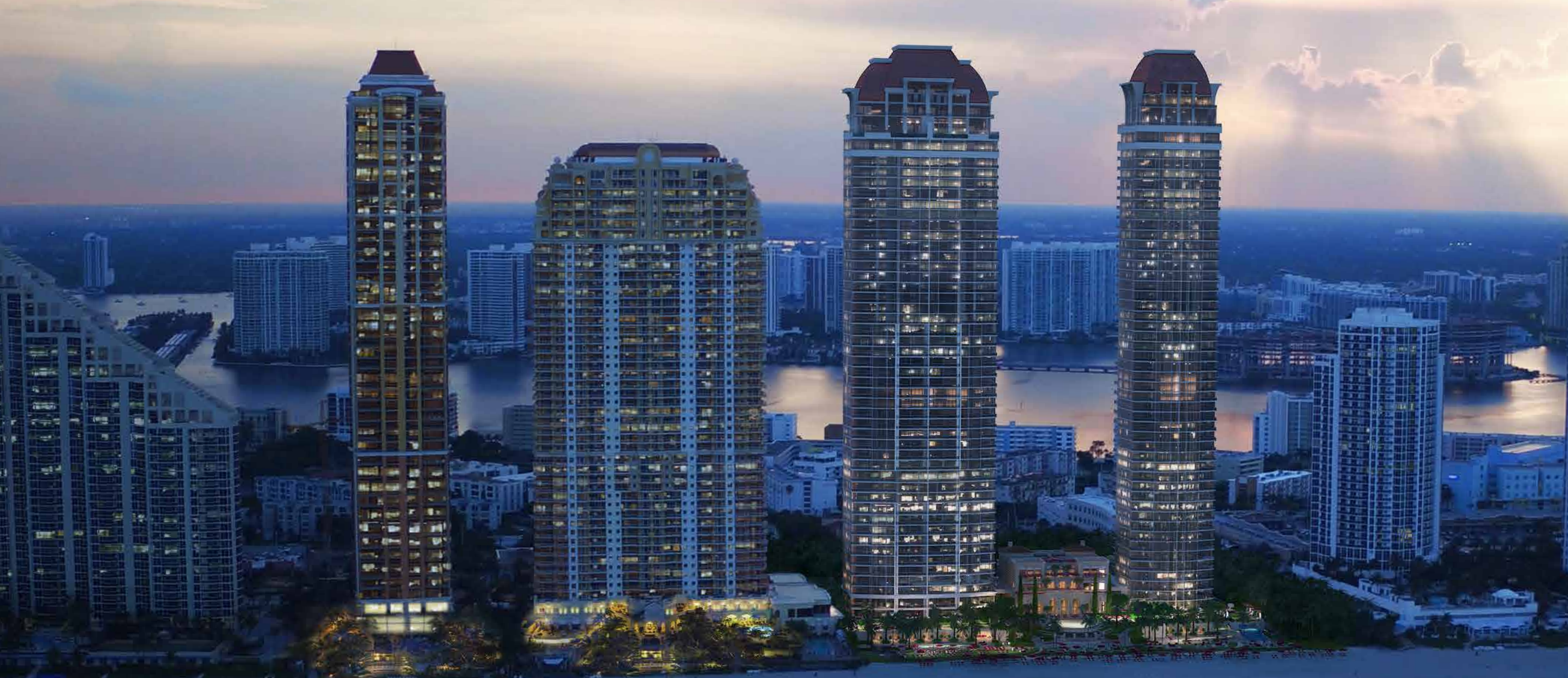
Left to right: THE MANSIONS at ACQUALINA , ACQUALINA RESORT , THE ESTATES at ACQUALINA SOUTH TOWER and THE ESTATES AT ACQUALINA BOUTIQUE TOWER .