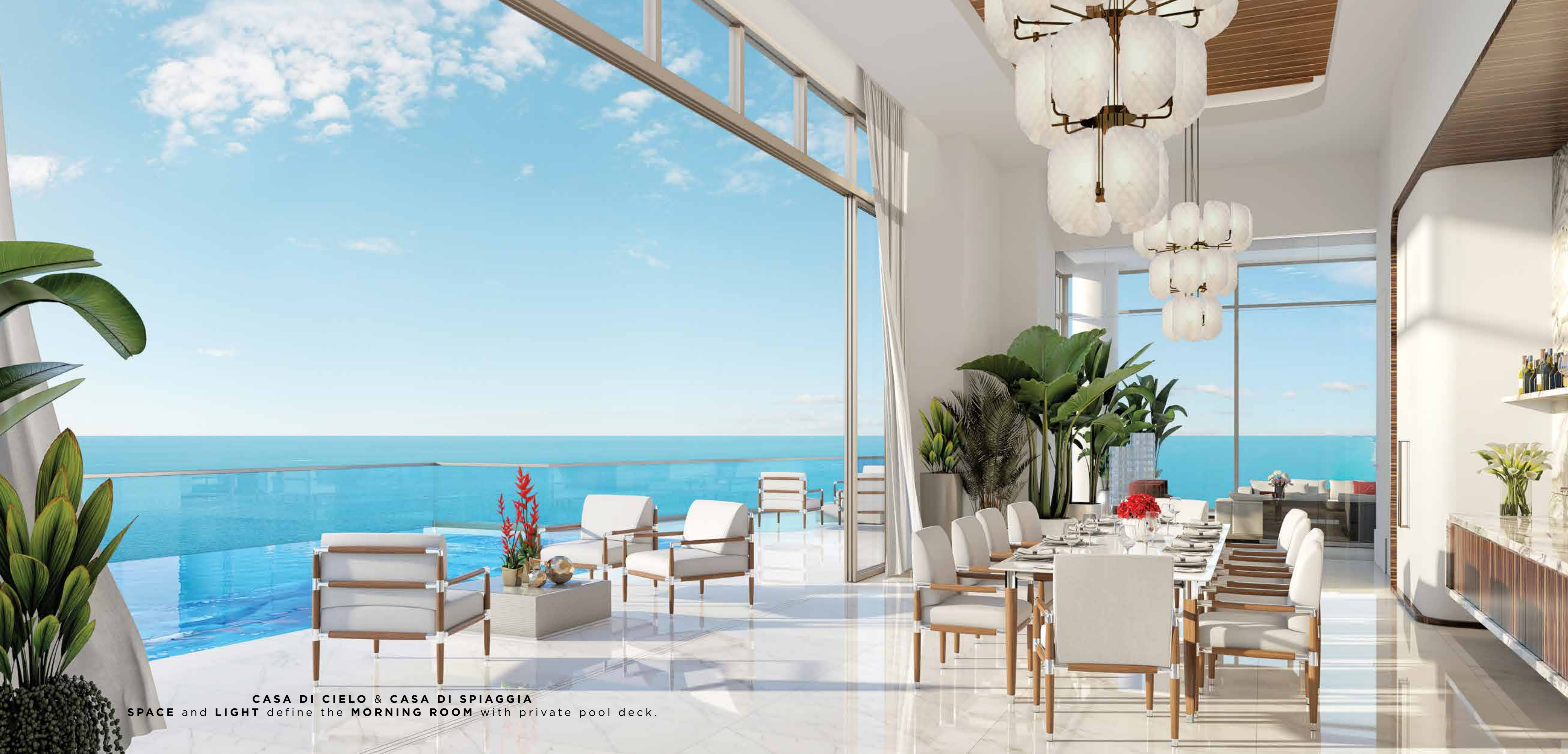
CASA DI CIELO & CASA DI SPIAGGIA SPACE and LIGHT define the MORNING ROOM with private pool deck.