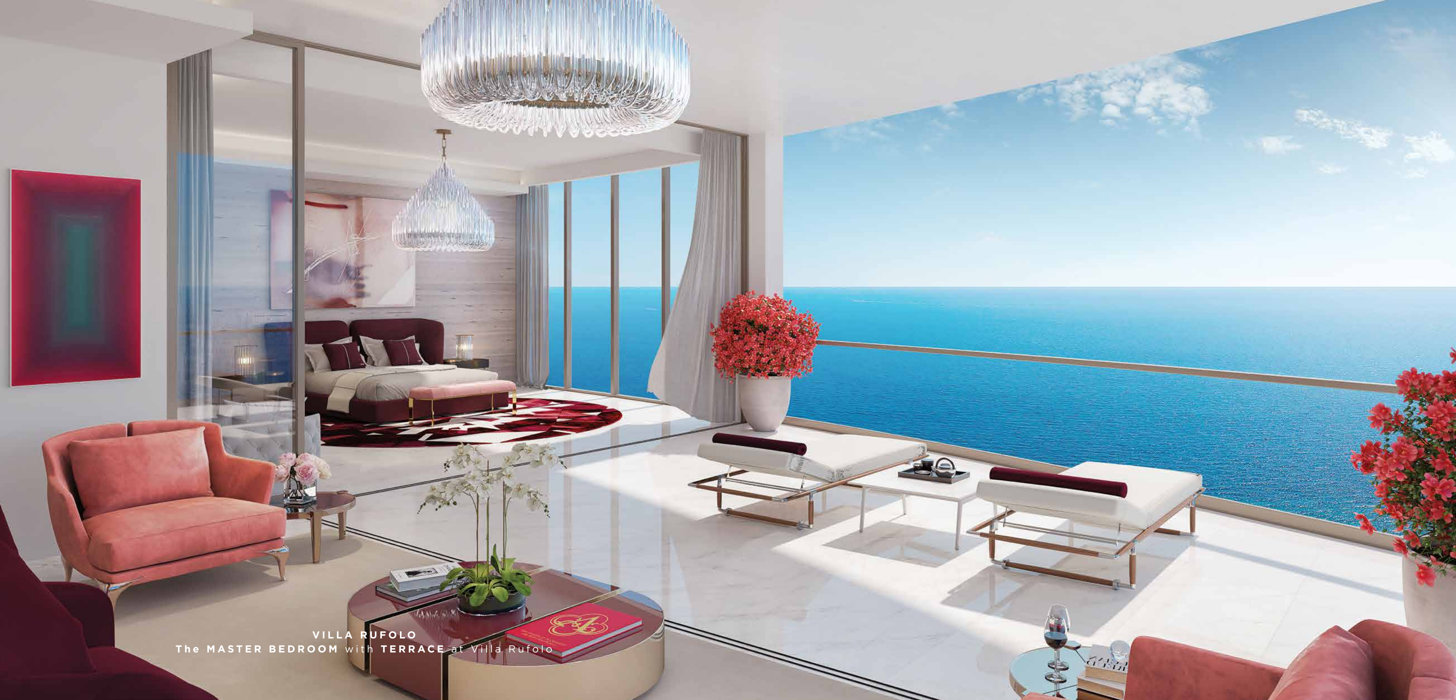
VILLA RUFOLLO The MASTER BEDROOM with TERRACE at Villa Rufolo