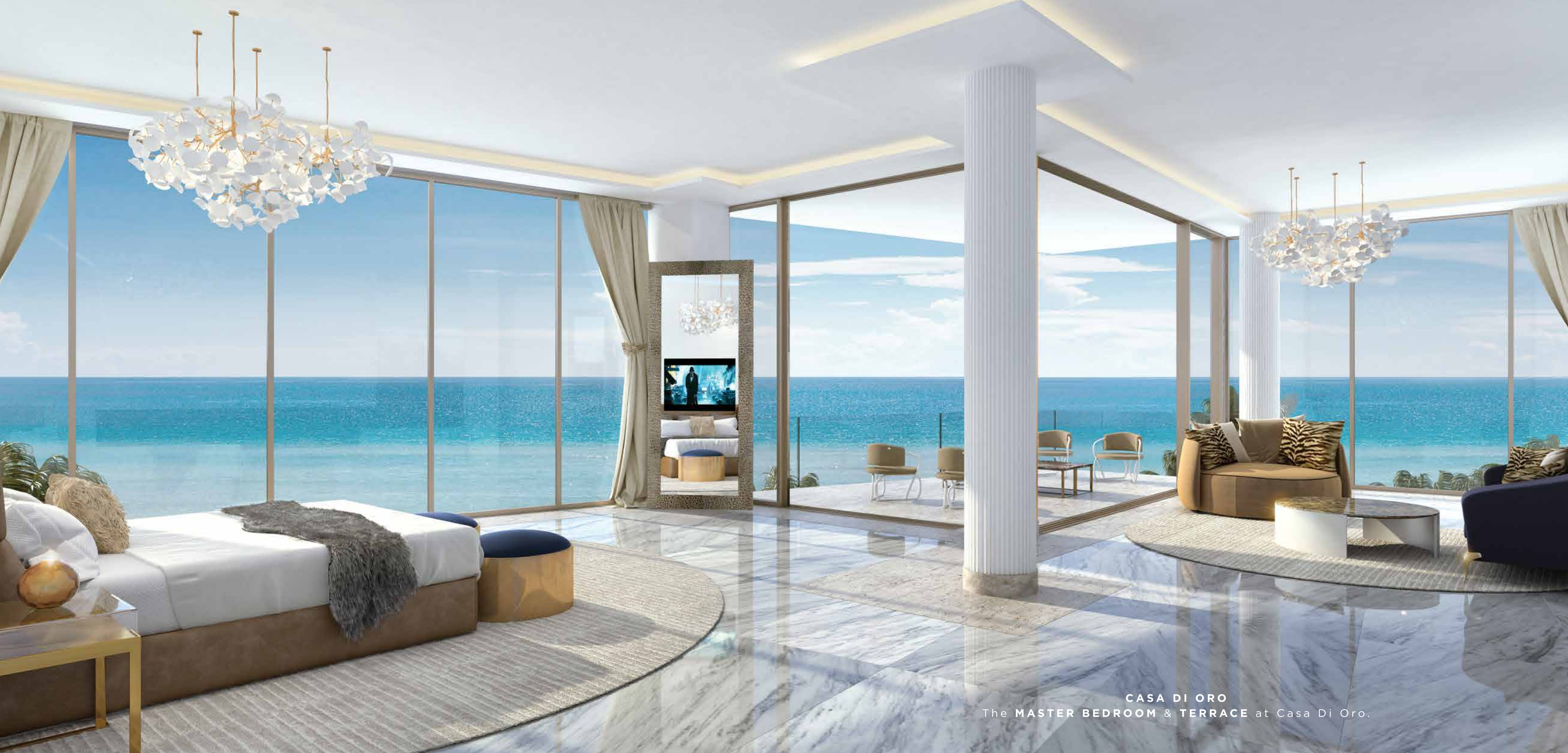
CASA DI ORO The MASTER BEDROOM & TERRACE at Casa Di Oro.