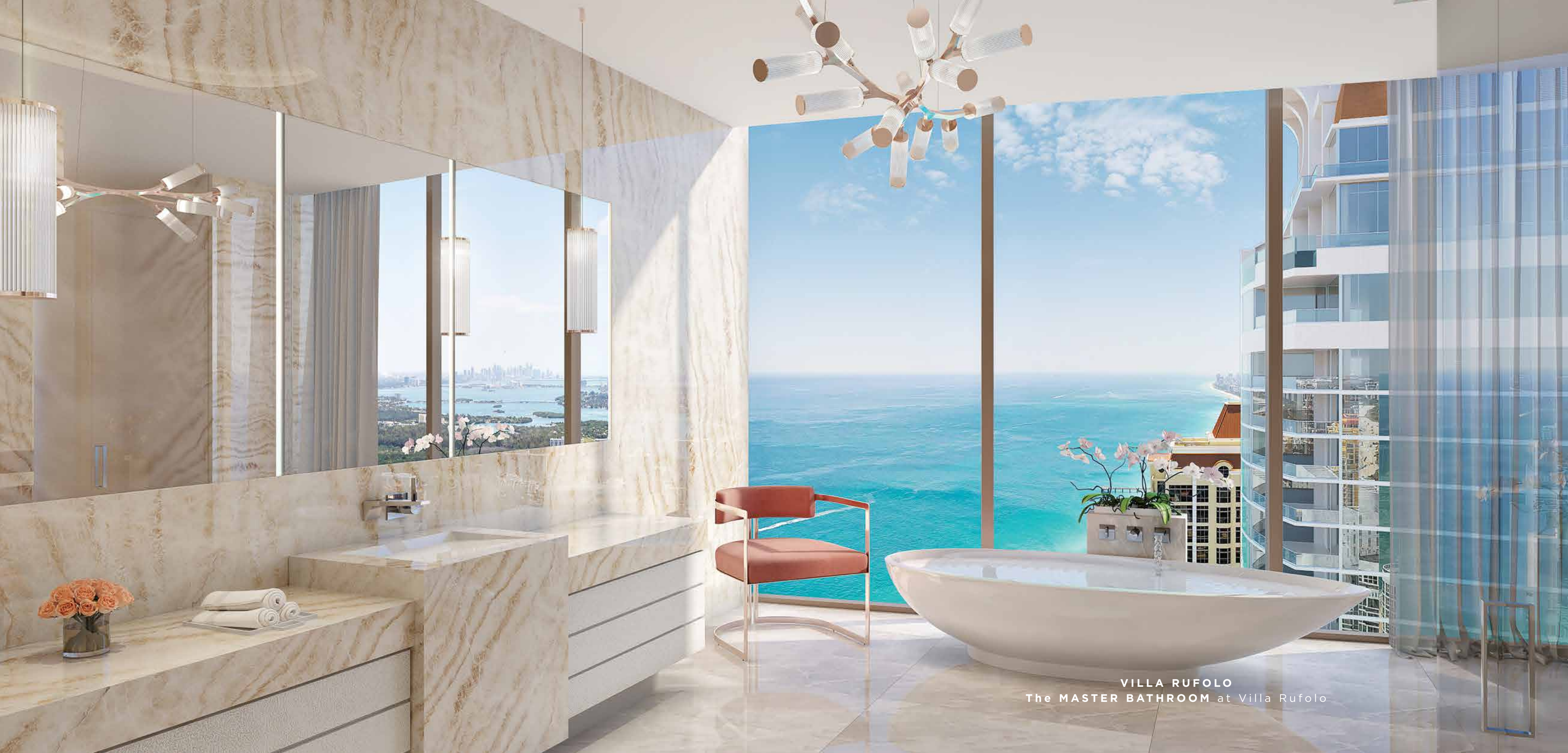
VILLA RUFOLO The MASTER BATHROOM at Villa Rufolo