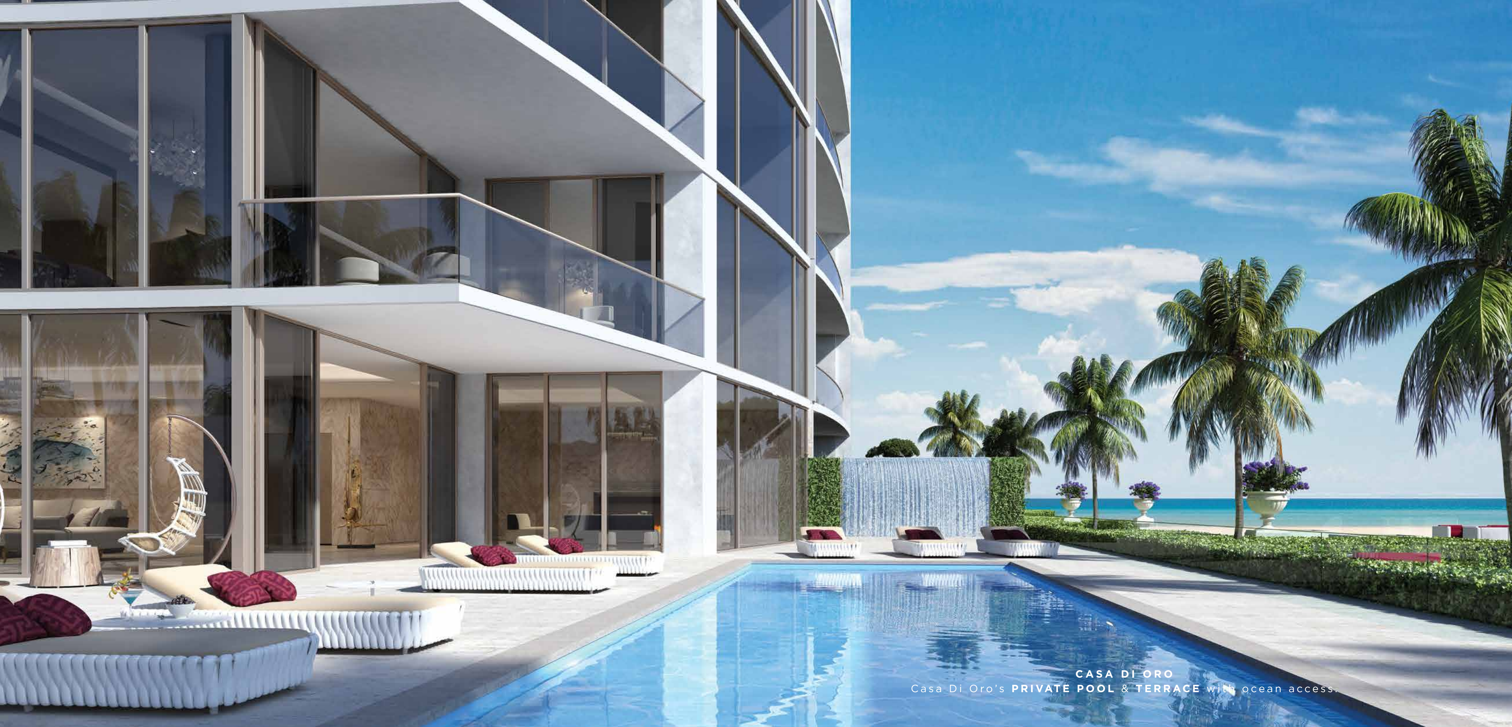
CASA DI ORO Casa Di Oro's PRIVATE POOL & TERRACE with ocean access.