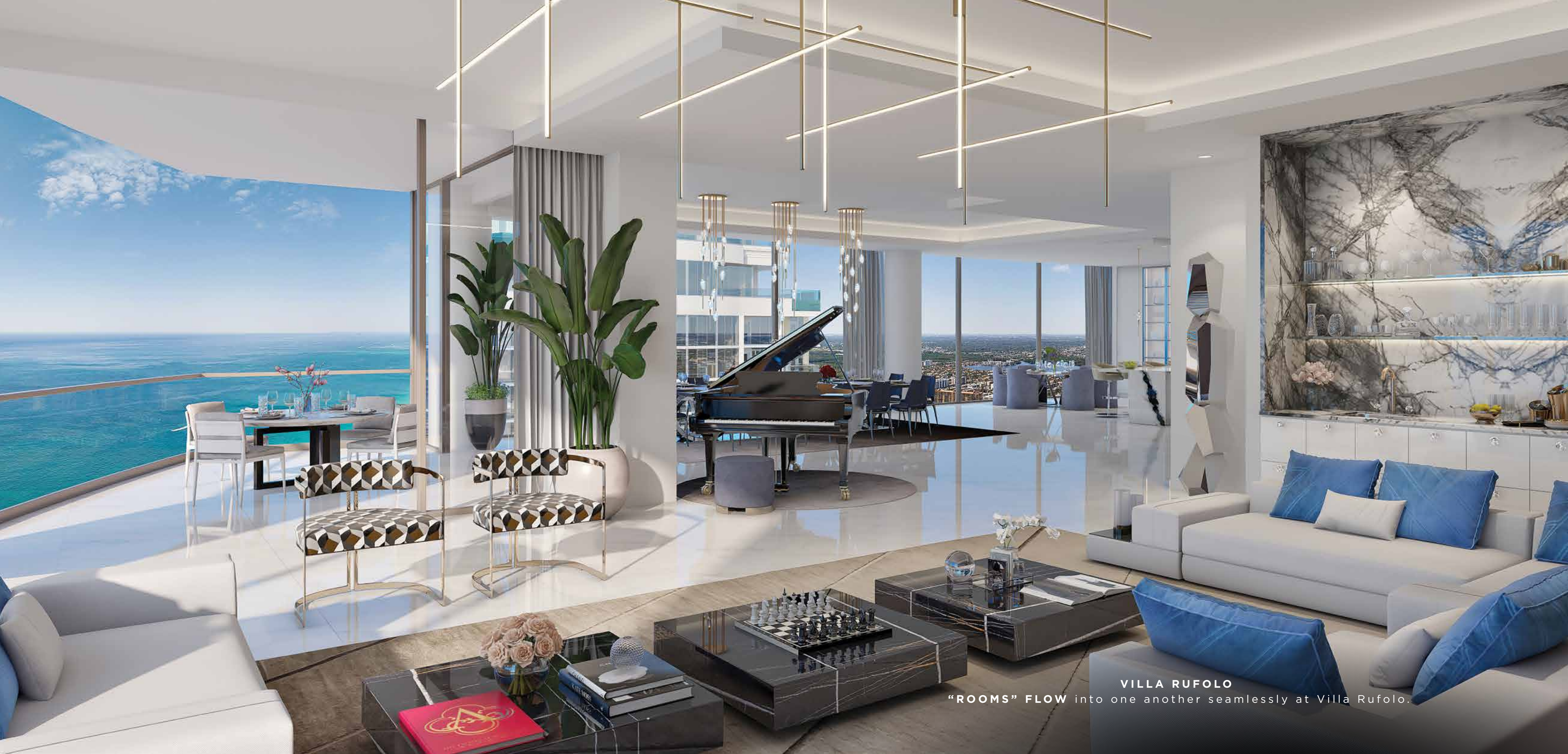
VILLA RUFOLO "ROOMS" FLOW into one another seamlessly at Villa Rufolo.