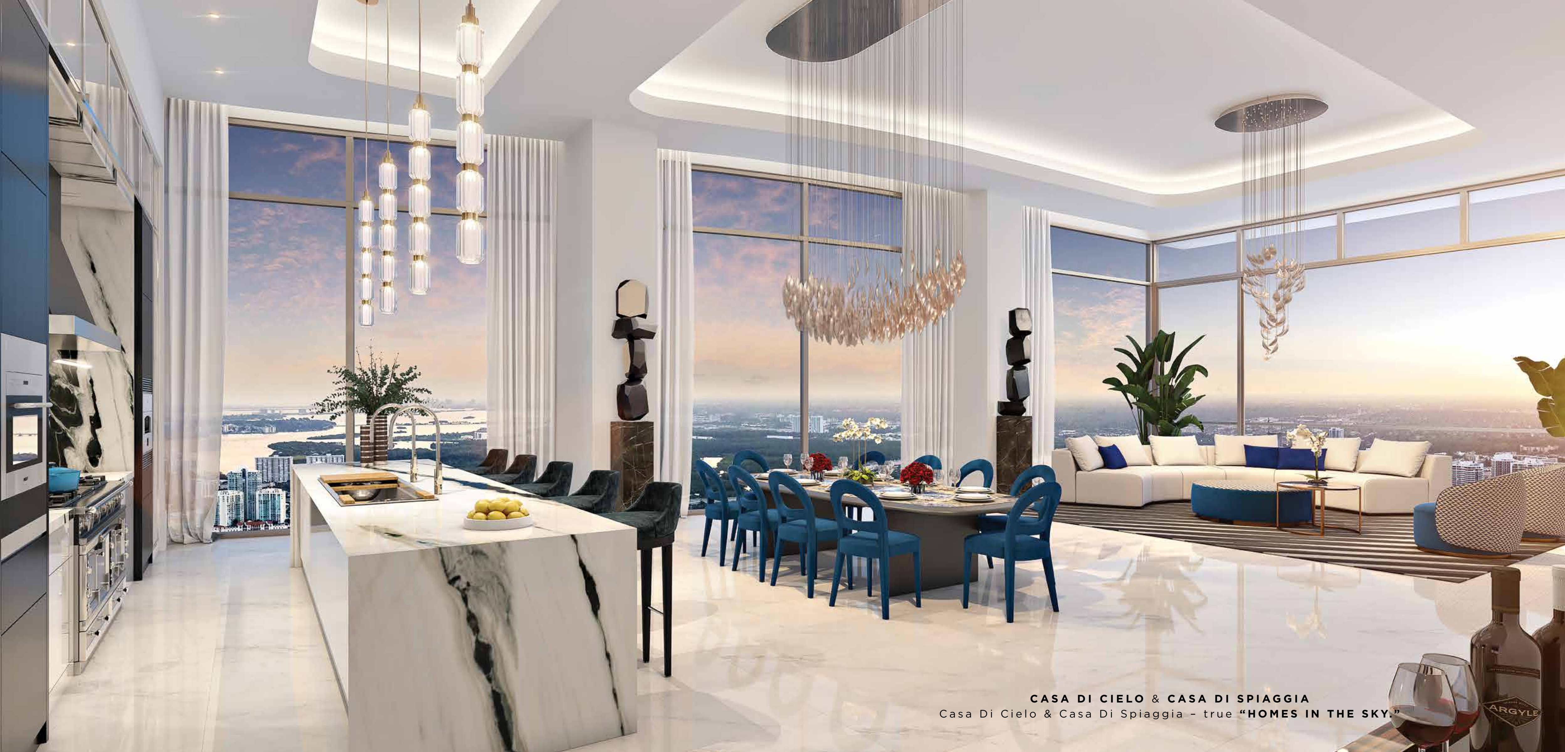
CASA DI CIELO & CASA DI SPIAGGIA Casa Di Cielo & Casa Di Spiaggia - true "HOMES IN THE SKY."