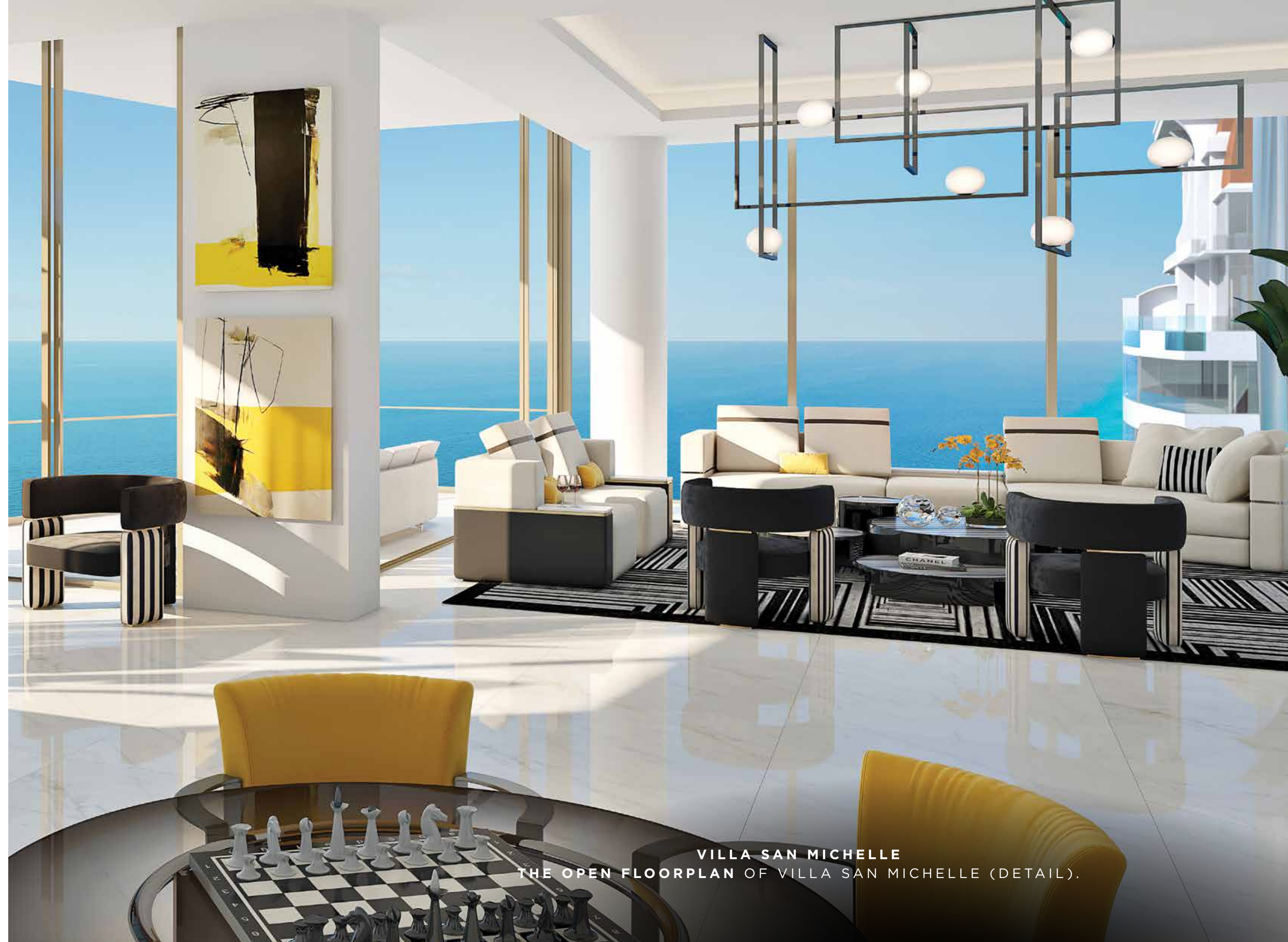
VILLA SAN MICHELLE THE OPEN FLOORPLAN OF VILLA SAN MICHELLE (DETAIL).

A full-floor featuring six bedrooms, seven bathrooms, two powder rooms, great room, family room, recreation room, fitness room with sauna, service room, optional office and learning room, fireplace, private elevators and sunset + ocean outdoor lounges + summer kitchen.