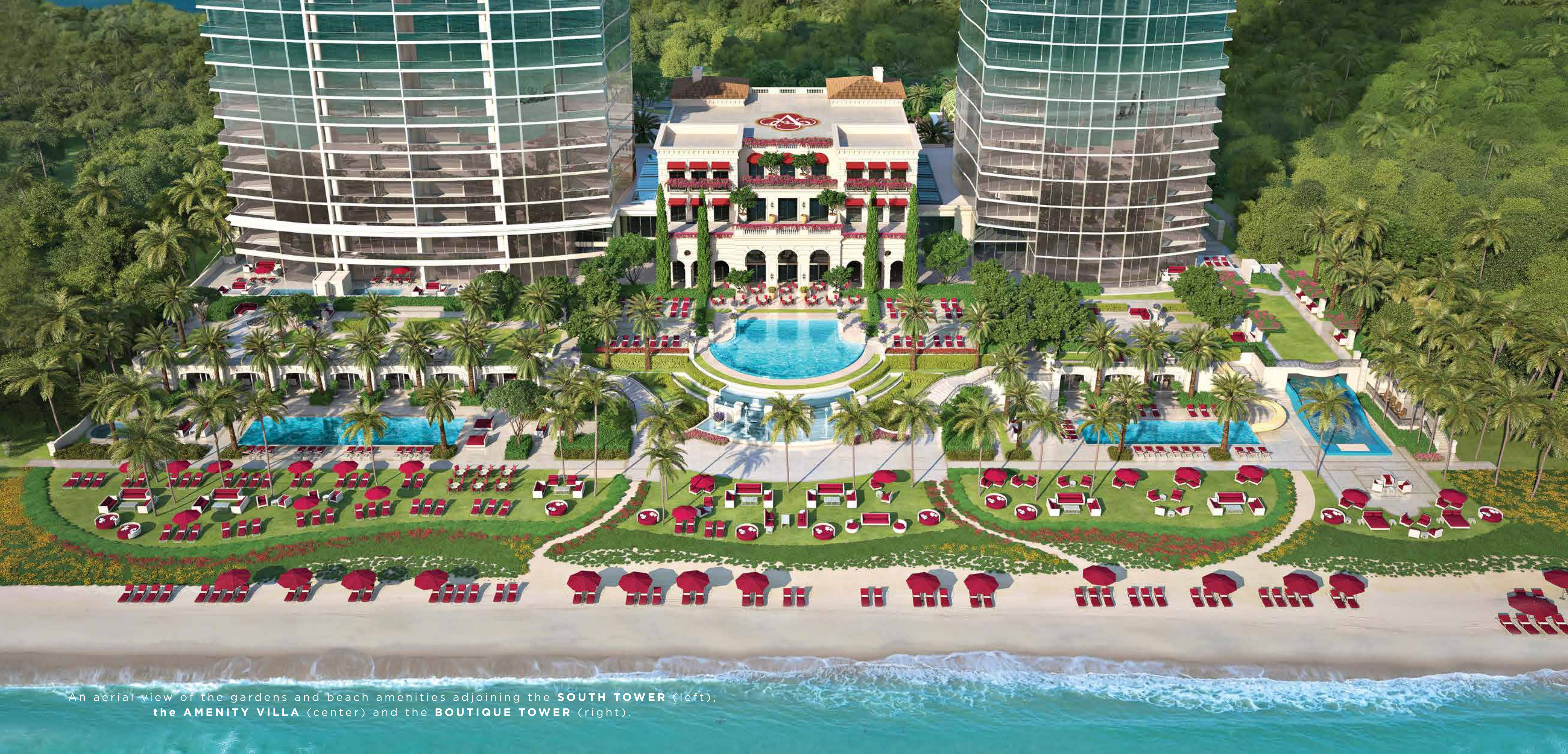
An aerial view of the gardens and beach amenities adjoining the SOUTH TOWER (left), the AMENITY VILLA (center) and the BOUTIQUE TOWER (right).