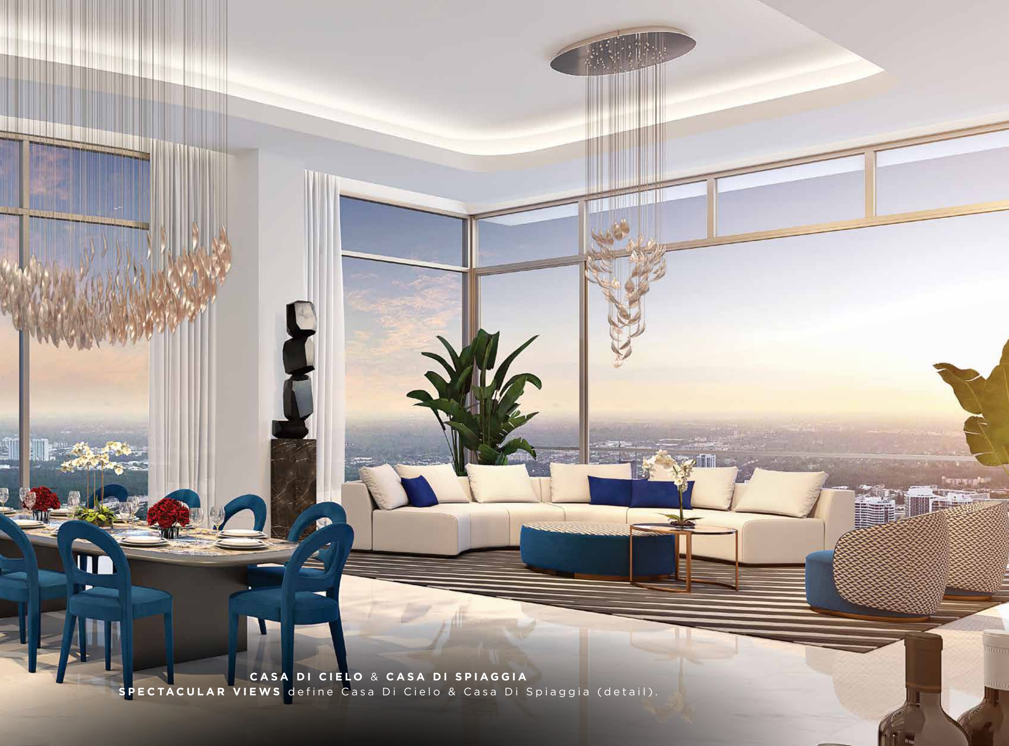
CASA DI CIELO & CASA DI SPIAGGIA SPECTACULAR VIEWS define Casa Di Cielo & Casa Di Spiaggia (detail).