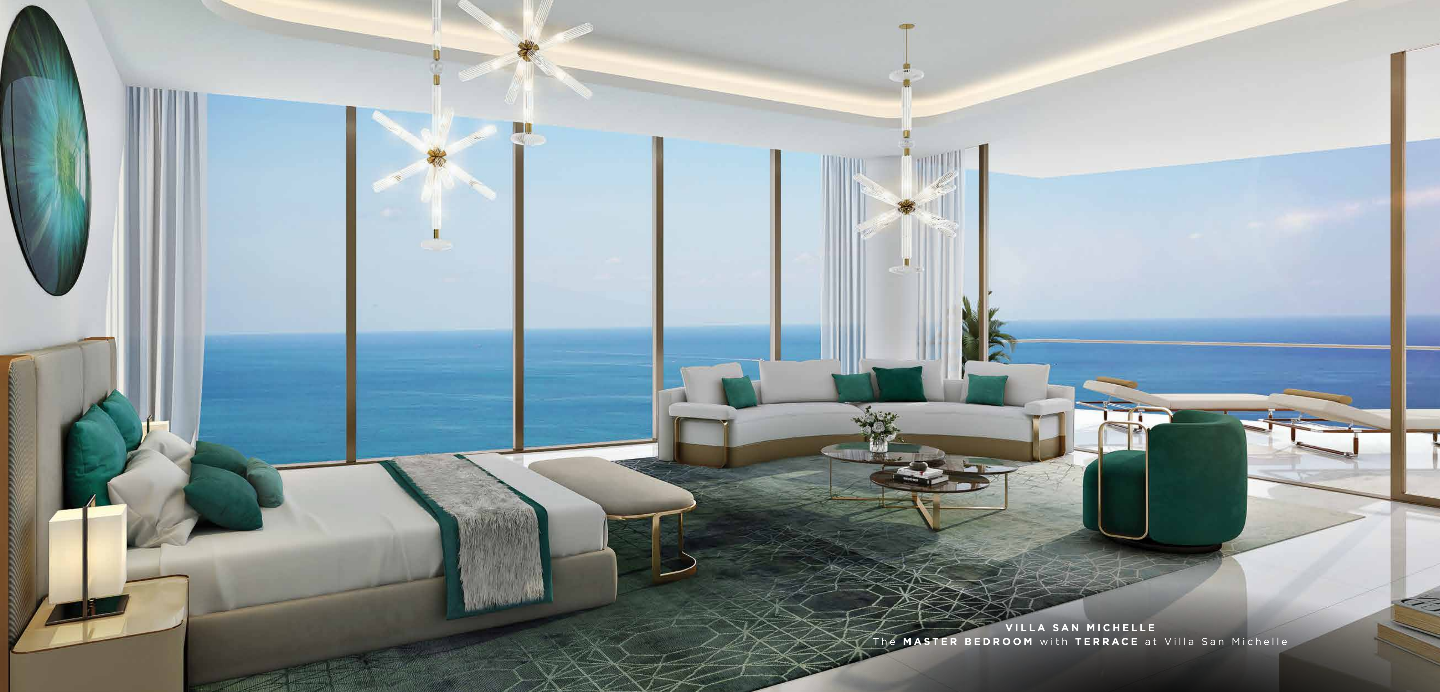
VILLA SAN MICHELLE The MASTER BEDROOM with TERRACE at Villa San Michelle