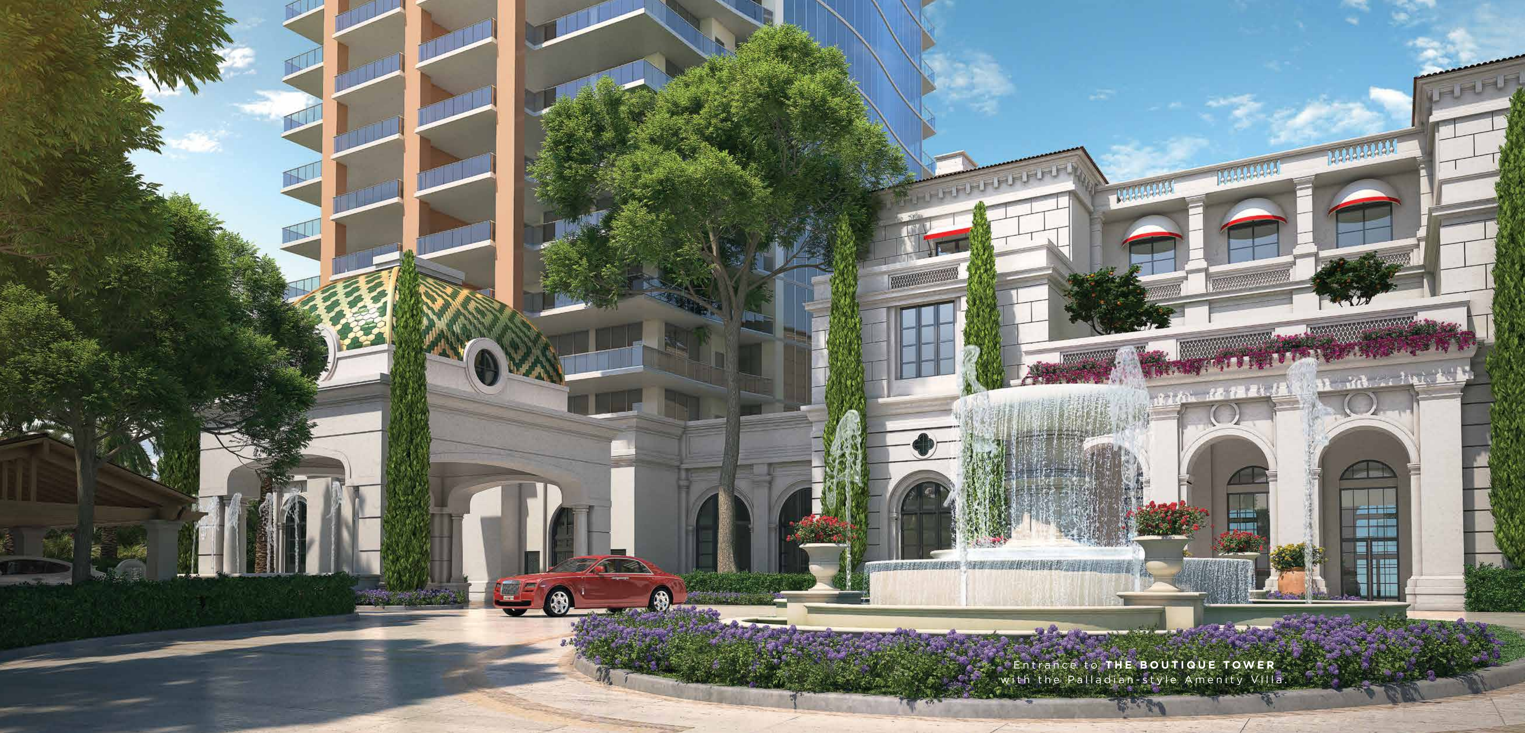
Entrance to THE BOUTIQUE TOWER with the Palladian-style Amenity Villa.