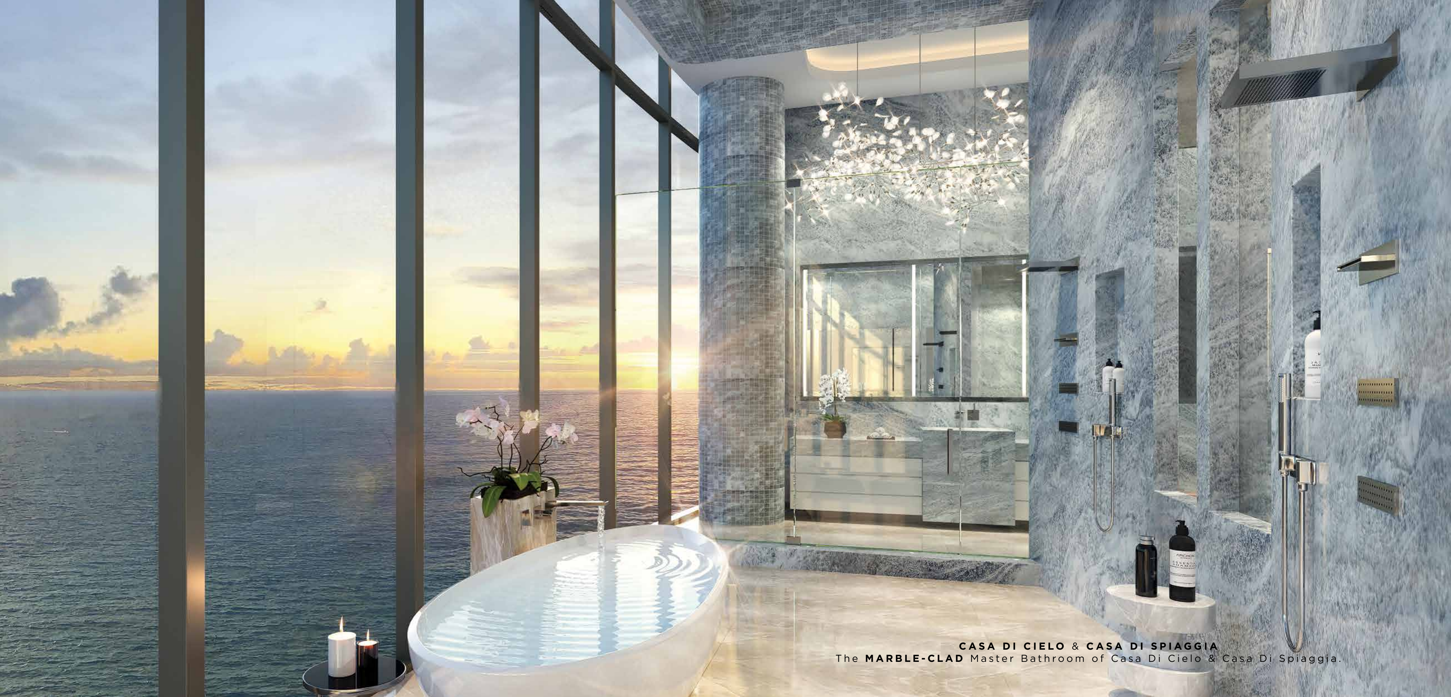
CASA DI CIELO & CASA DI SPIAGGIA The MARBLE-CLAD Master Bathroom of Casa Di Cielo & Casa Di Spiaggia.